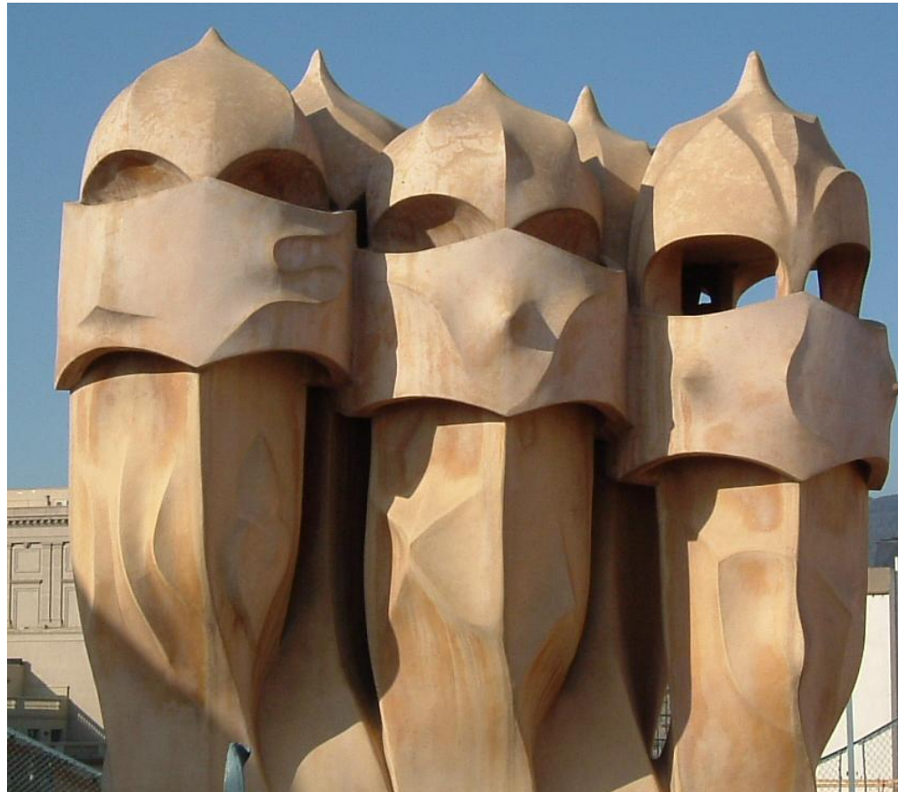
Gaudi - Barcelona