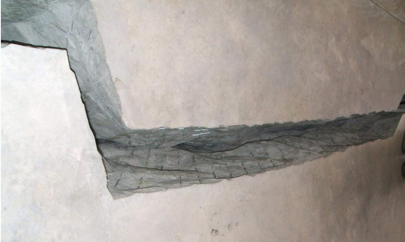
Shibboleth - Doris Salcedo, Tate Modern